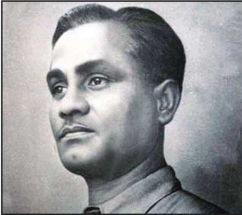
Major Dhyan Chand

Dear Students, bring this scene before your eyes before reading this lesson :