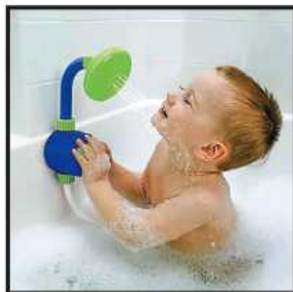
Cleanliness of the skin

2. Cleanliness of the Hair : Long hair add charm to one's beauty. Balanced diet contributes a lot to make the hair beautiful and strong. Hair should be combed daily with a clean comb. They should be washed time after time. They should be dried properly after washing. Hair should be nourished well to make them strong. Lice do not develop if the