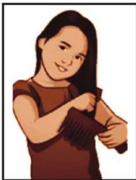
Cleanliness of the hair