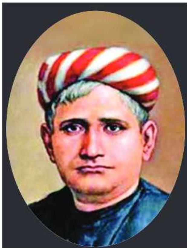
Bankim Chandra Chatterjee

Our country, India attained freedom on 15th August, 1947. With a view to maintain the freedom and to instill the sentiments of unity and zeal, the two songs given recognition are ' Jana-Gana-Mana ' and ' Vande Mataram '. Both the songs are deeply associated with the struggle for the freedom of country.